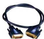
CBL-DVI Crestron® Certified DVI-D Interface Cable