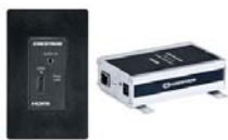
HD-EXT2-C HDMI® over Shielded Twisted Pair Extender