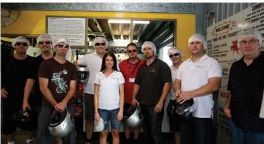
Crestron Conference delegates putting the pedal to the metal at Cairns Go Karts

World AV leader Crestron sent some of its leading lights to Cairns in early March, in a clear signal of the importance it places on Australia and New Zealand's fast-growing digital networking market.