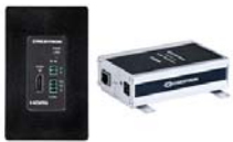
HD-EXT1-C HDMI® over Shielded Twisted Pair Extender

To ensure you don't miss out on this opportunity, please call your local Crestron representative now to make an appointment with our team.