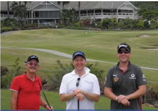
Crestron Conference delegates enjoyed a round of golf at Paradise Palms Award Winning Golf Course