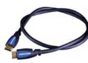
CBL-HD Crestron® Certified HDMI™ Interface Cable