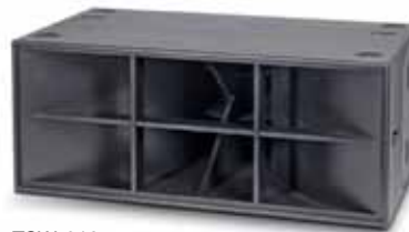
TSW-218 HORN-LOADED SUB-BASS LOUDSPEAKER