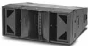
TFA-600H TRAPEZOIDAL 3-WAY LOUDSPEAKER

All models are also available in networkable, digitally self-powered formats