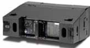
TFA-600HDP SELF-POWERED 3-WAY LOUDSPEAKER