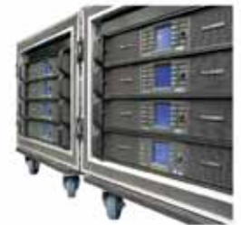
LAB.GRUPPEN PLM SERIES