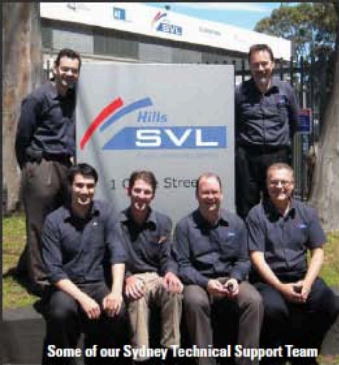
Some of our Sydney Technical Support Team

The diverse range of products offered by Hills SVL is complemented by the expertise of the Hills SVL Technical Support Team. Integration is the future, and with an eight-person Technical Support team, customers will enjoy the peace of mind that a technical expert is just a phone call away.