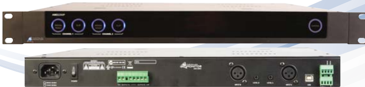
Australian Monitor AMD2200P Power Amplifier